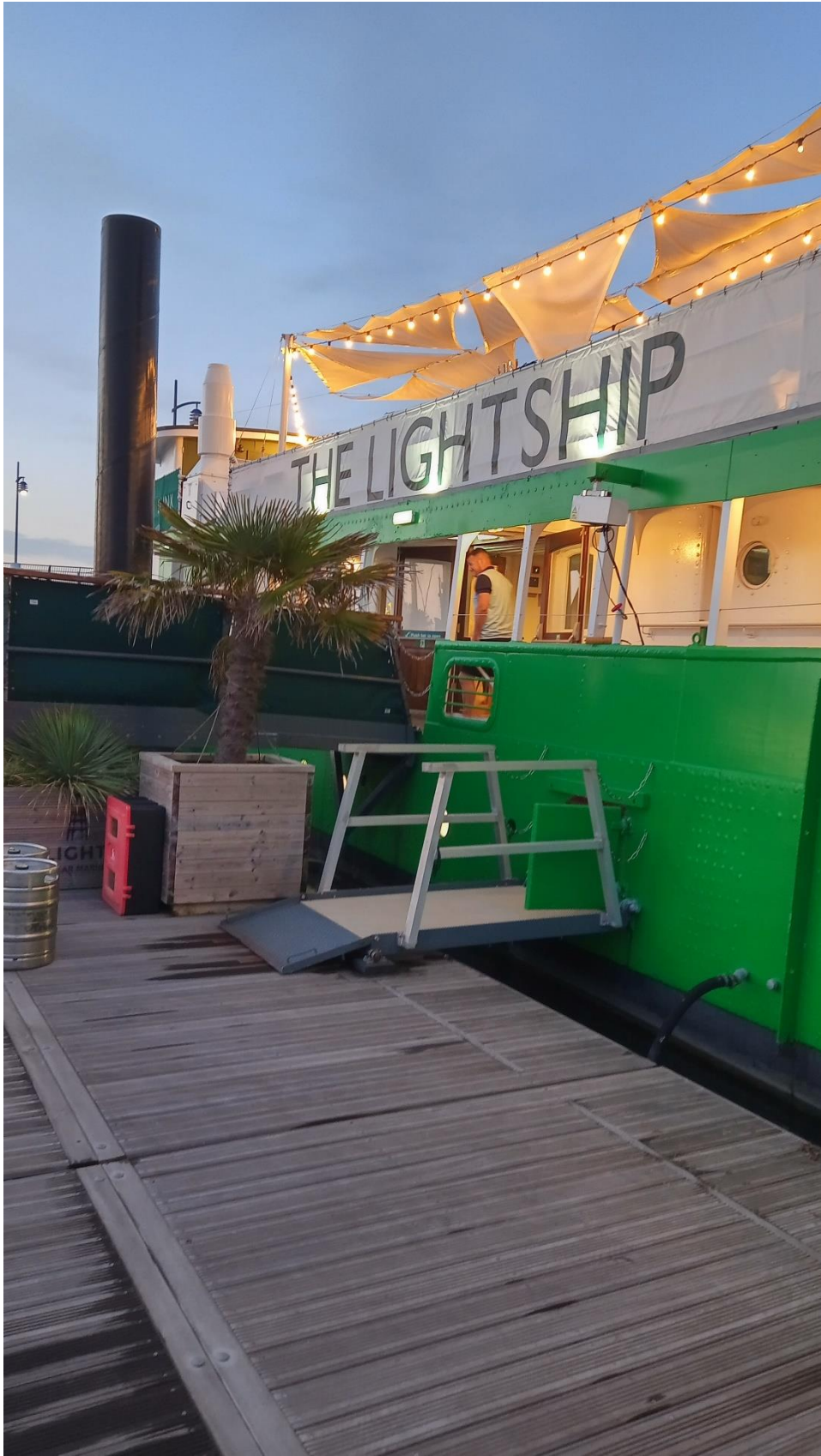
The Lightship (inside)