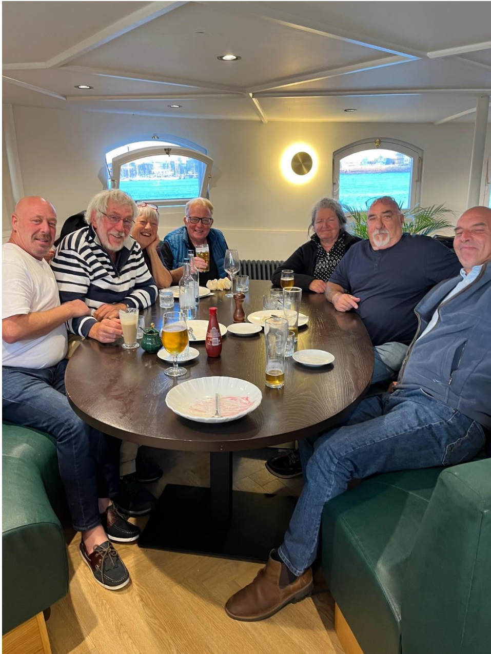
Enjoying dinner at the Lightship